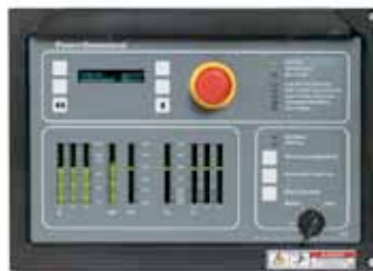
PowerCommand 2100 control operator/display panel